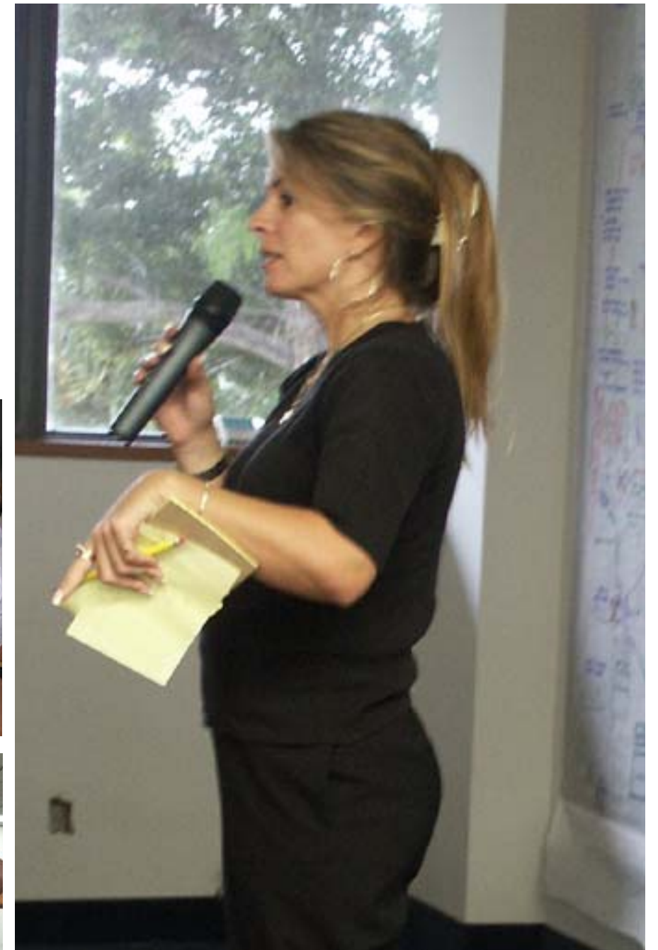
Images from the November 2003 Charrette North Federal Highway Courtyard Building, Boca Raton, Florida.