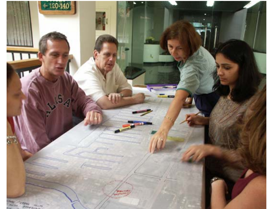
Views of the residents drawing and sharing their ideas